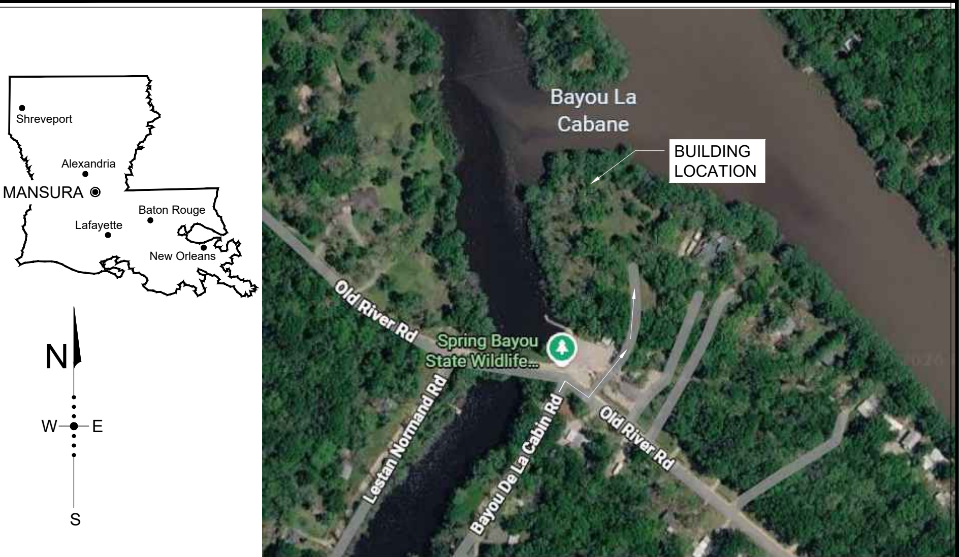
MAP OF MANSURA AT OLD RIVER

LOCATED AT 1135 OLD RIVER ROAD MANSURA, LOUISIAN